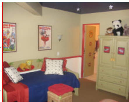
Room #106 at Ronald McDonald House