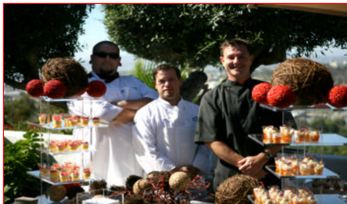
Urban Kitchen Culinary Team Laurel/Chive/Kensington Grill